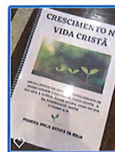
our new SS material we made